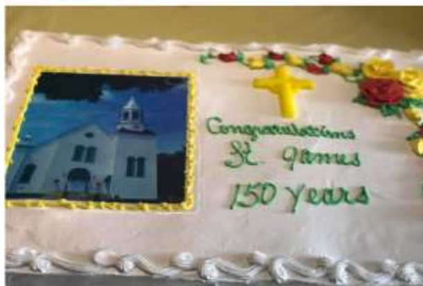
Top Left: St. James Church, Island Pond