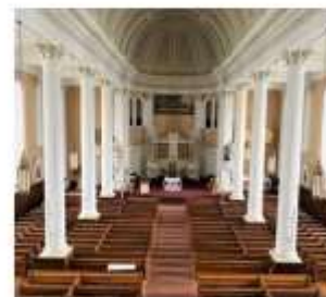
Website photo interior

Vermont State Council Knights of Columbus Officer Installation 2021