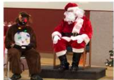
Santa and Rudolph