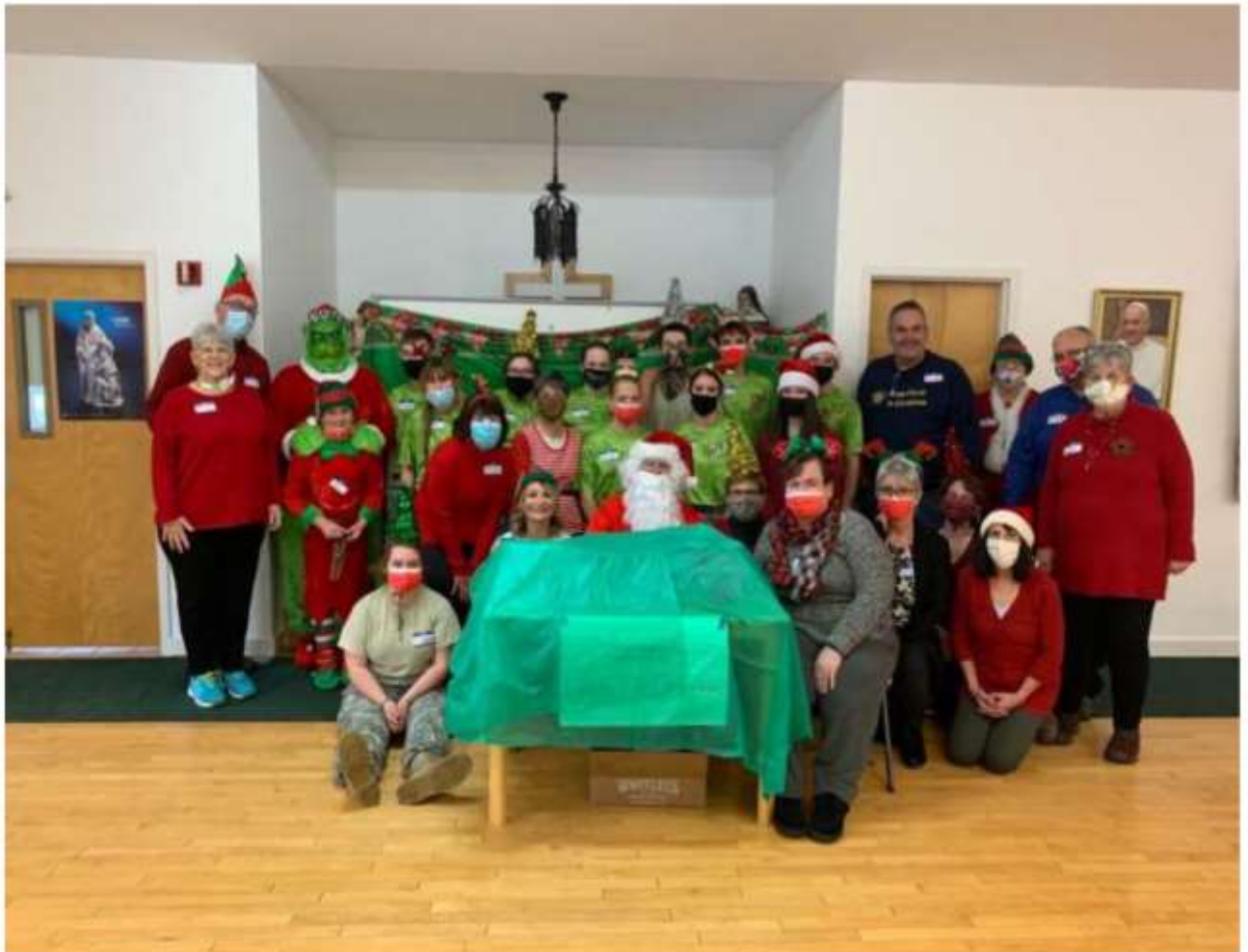
Santa, the Grinch and all the Elves who helped with Cookies and Shopping with Santa

There were many smiles in Derby Line on December 4 th and many requests to put this on again next year.