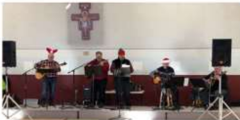
Gravelin Brothers Band