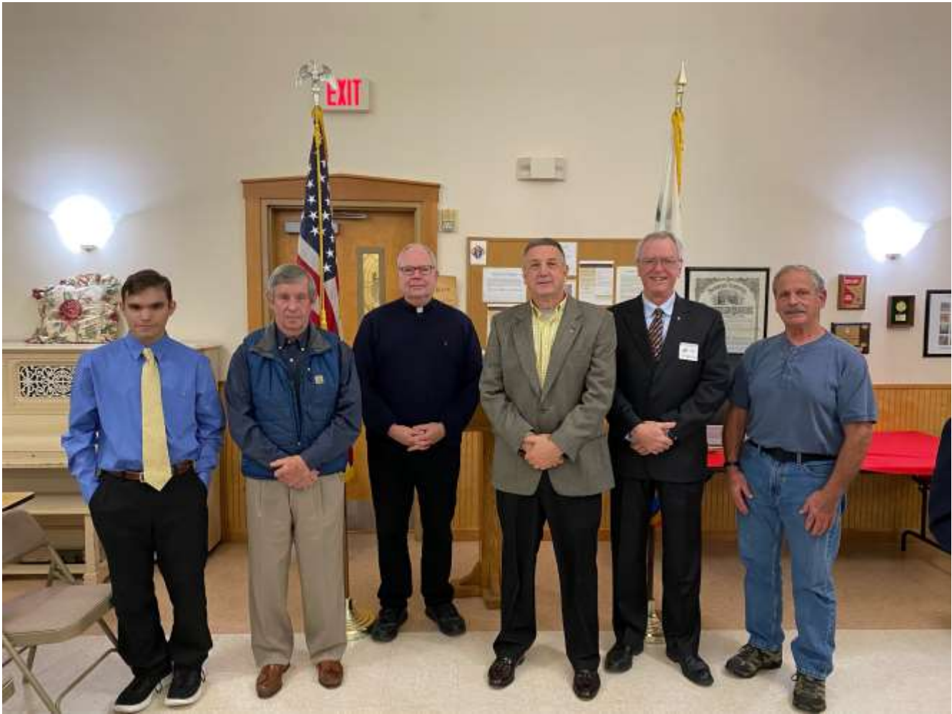
Photo from our recent Exemplification on November 9, 2021.