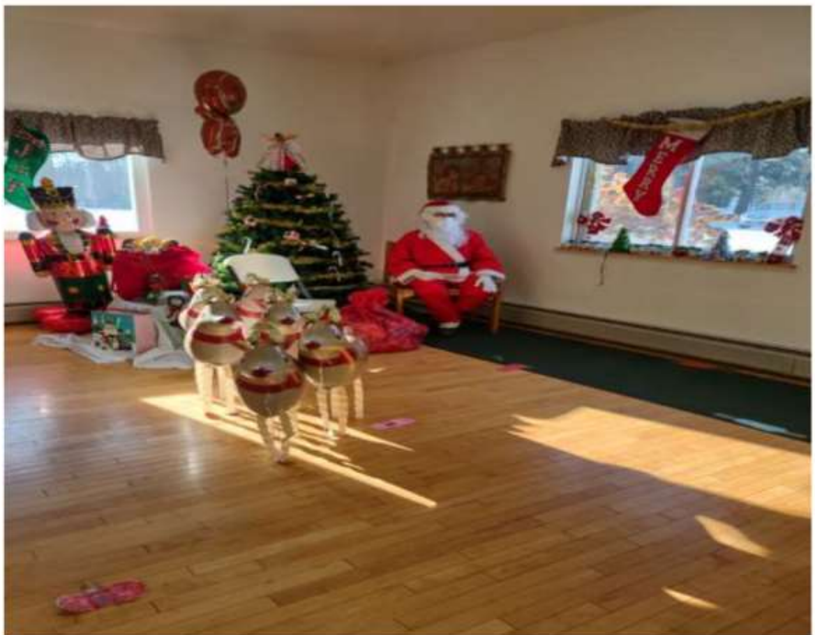
Santa and his reindeer waiting to give out toys and $1 bills. The toolboxes were a hot item!