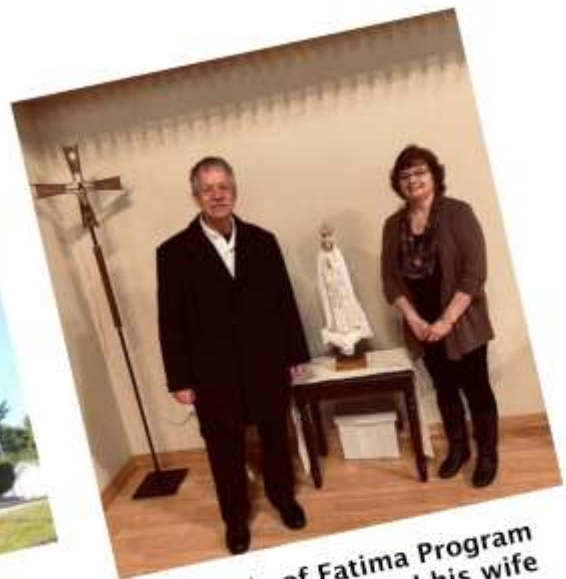
Our Lady of Fatima Program District Deputy and his wife