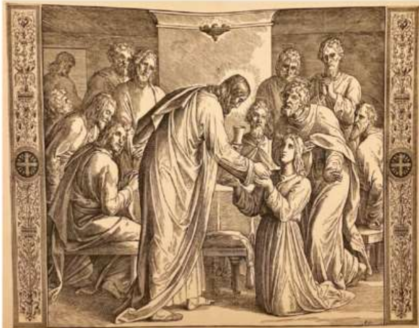
The Instruction of the Blessed Eucharist.

Worthy Brothers and Sir Knights, I wish to remind you to continue to pray for the unborn and to participate in the renewal of devotion to the Holy Eucharist. January 28, 2023, saw many of us at the Vermont March for Life in Montpelier, VT. As you know, the overturn of Roe v Wade has not reduced the dangers facing the unborn, especially in Vermont considering Amendment 22. Our Worthy State Chaplain has written a very moving Holy Scripture Rosary focused on the Holy Eucharist. I recommend these prayers as a part of your First Friday devotions.