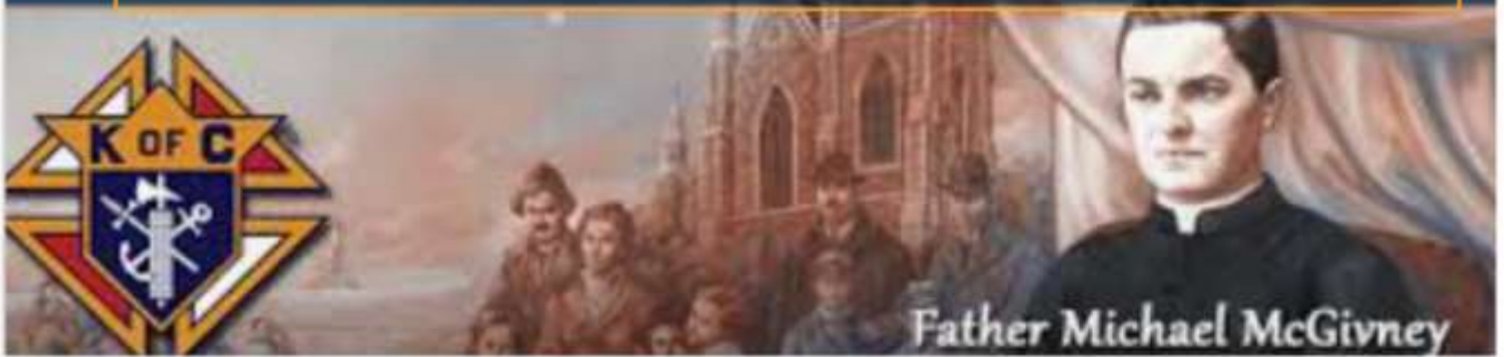
Father Michael McGivney