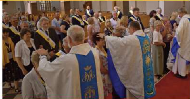
Priests bless Knights and spouses participating in Husband and Wife Day at the Basilica of Our Lady of the Gate of Dawn in Skarżyska-Kamienna, Poland.

Sts. Louis and Zélie Martin inspired Knights in Poland to begin a new tradition: a special day devoted to the vocation of marriage. Husband and Wife Day is now celebrated throughout the jurisdiction on July 13, the anniversary of the Martins' wedding. READ MORE