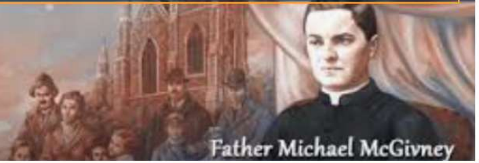
Father Michael McGivney