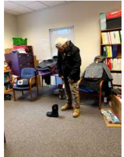
Glover Graded School Kids receiving their Coats for Kids