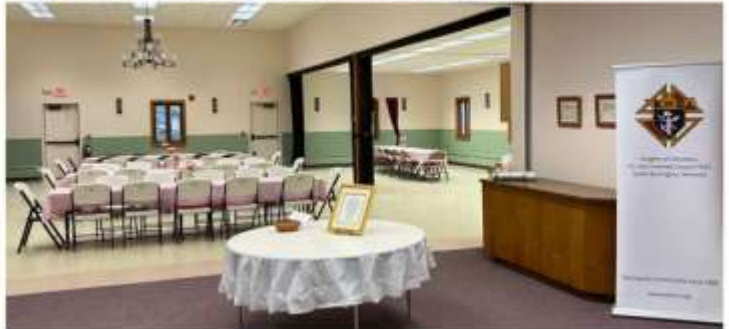
Hospitality Committee did a great job with decorations and set-up!