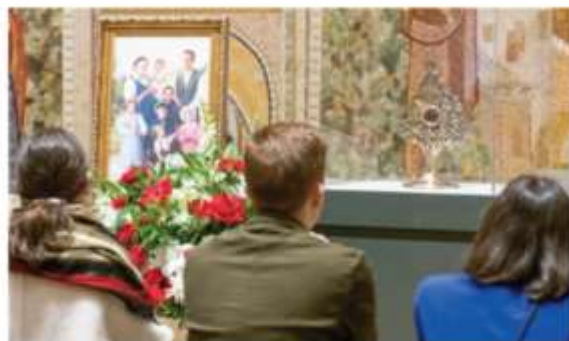
Visitors to the Saint John Paul II National Shrine in Washington pray before a reliquary of the Ulma family Jan. 12.

The Saint John Paul II National Shrine in Washington, D.C., recently welcomed relics of the nine members of the Ulma family, who were killed during World War II for harboring Jews and beatified in September. The relics will be available for veneration at the shrine through at least March 24, the 80th anniversary of the Ulmas' martyrdom, and will be present at Life Fest on Friday, Jan. 19. READ MORE