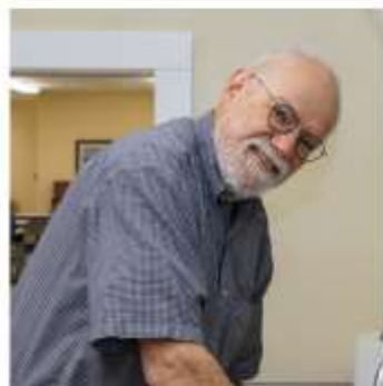
Left/Right: Smiles all around at the annual Palm Sunday Pancake Breakfast on April 2nd!