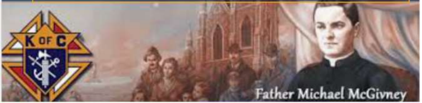
Father Michael McGivney