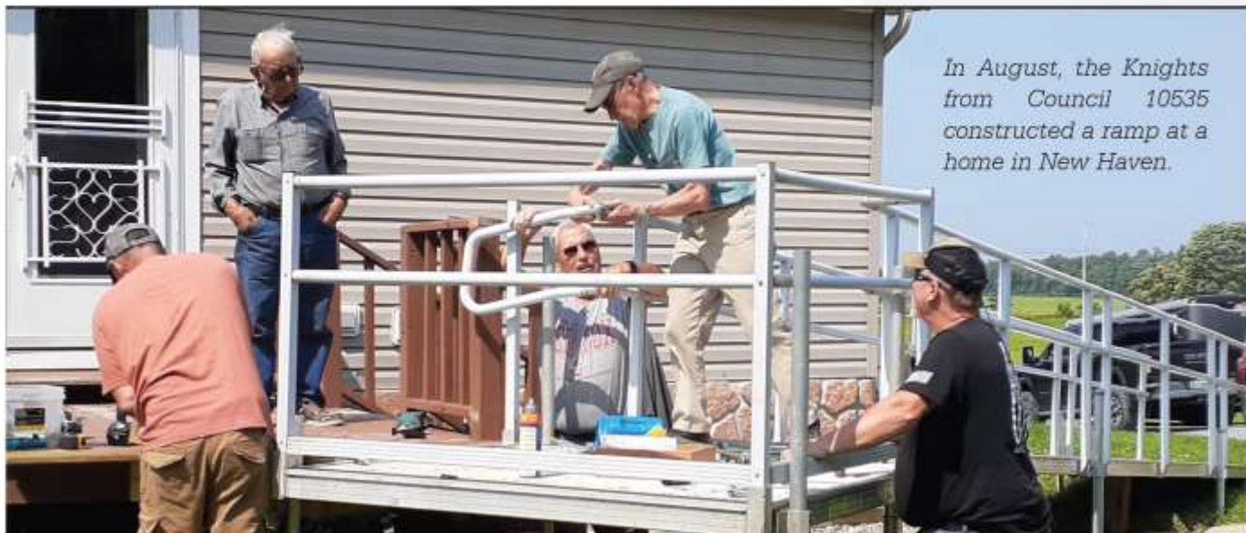
In August, the Knights from Council 10535 constructed a ramp at a home in New Haven.

Dates subject to change and more stay tuned for more!