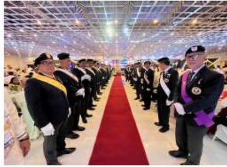
Sir Knights from the Visayas and Mindanao Jurisdictions of the Magellan Province prepare to welcome the Supreme Knight and Supreme Master at the closing banquet in Cebu City on August 27, 2024.